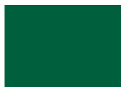
Cool Denali Green