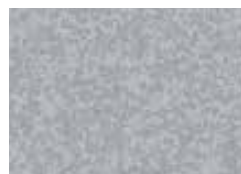
Cool ZINCALUME® Plus